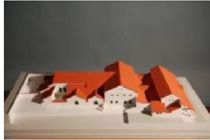
Model of the reconstructed Roman bath